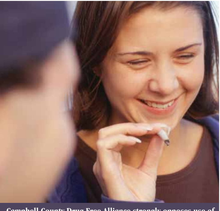
Campbell County Drug Free Alliance strongly opposes use of cannabis in any capacity, including youth and adults.

If we are asking you to think about what your position on marijuana would be, then it is only fair we share our position. Our Posi tion: Campbell County Drug