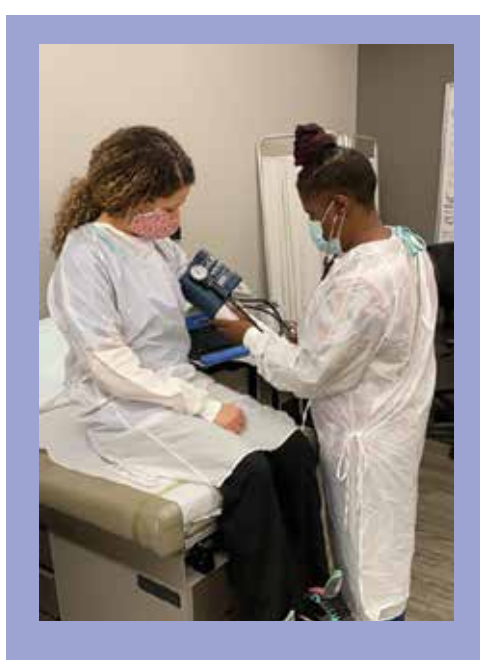
Brighton Center's Center for Employment Training offers innovative, shortterm workforce training programs in Medical Assisting and Health Technology Administration.

Health Technology Administration (HTA) trains individuals for a variety of front office, back office, and administrative careers in the healthcare industry. In