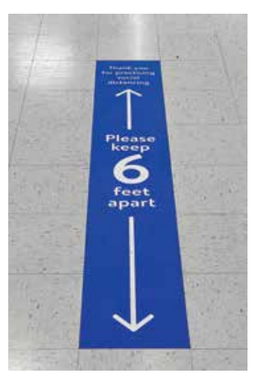
When you go out in public, keep 6 feet away from others and wear a mask that covers your mouth and nose.